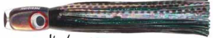
Voodoo - MT17/MT9