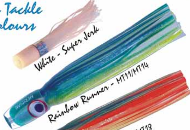
Rainbow Runner - MT11/MT14