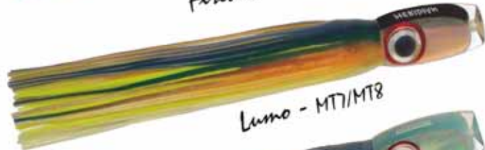
Lumo - MT7/MT8