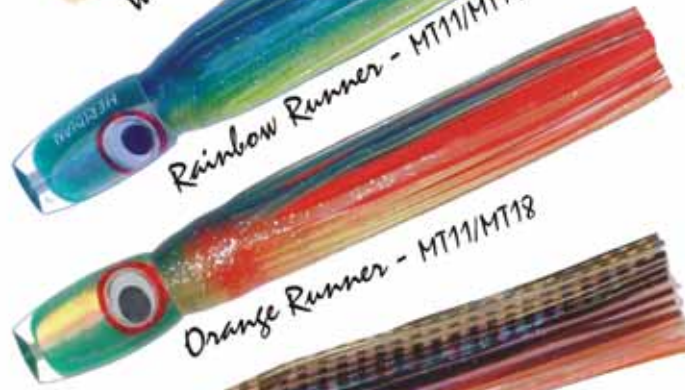
Orange Runner - MT11/MT18