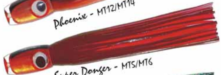
Super Danger - MT5/MT6