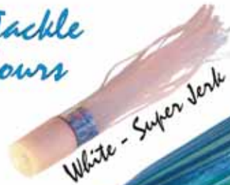
White - Super Jerk