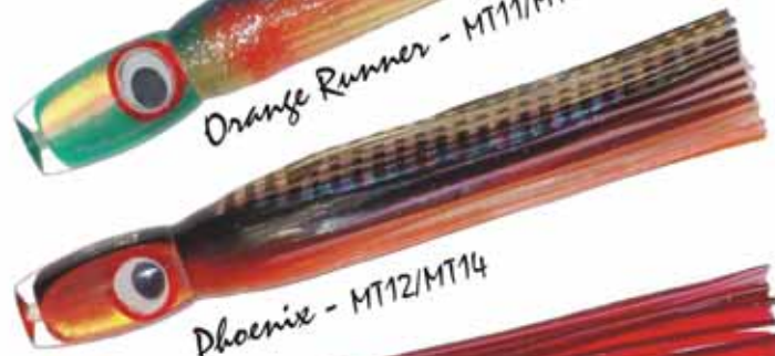
Phoenix - MT12/MT14