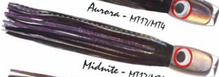
Midnite - MT17/MT1