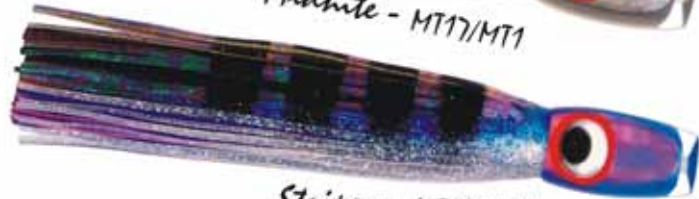
Stripey - MT13/MT2