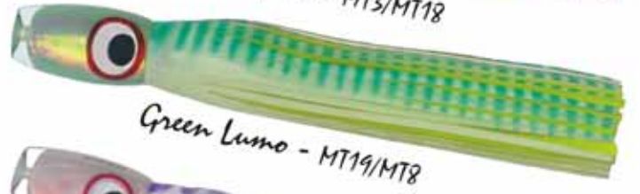
Green Lumo - MT19/MT8