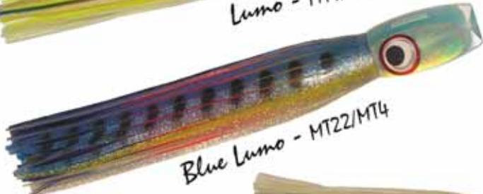
Blue Lumo - MT22/MT4