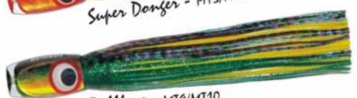
Bullfrog - MT9/MT10