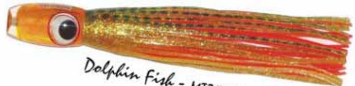
Dolphin Fish - MT3/MT18