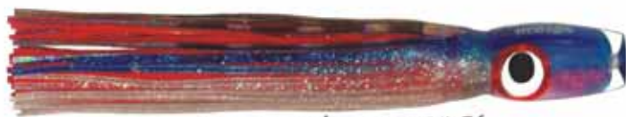
Blue Pacific - MT13/MT6