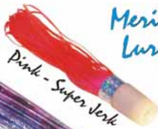
Pink - Super Jerk