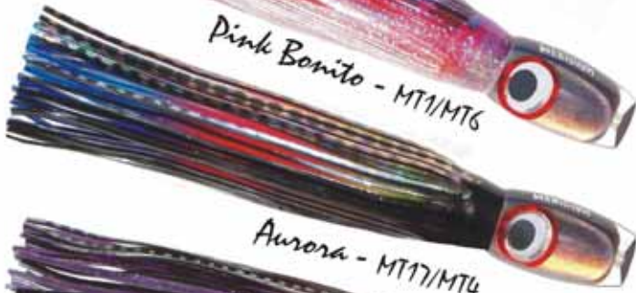
Aurora - MT17/MT4