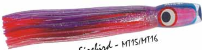
Firebird - MT15/MT16